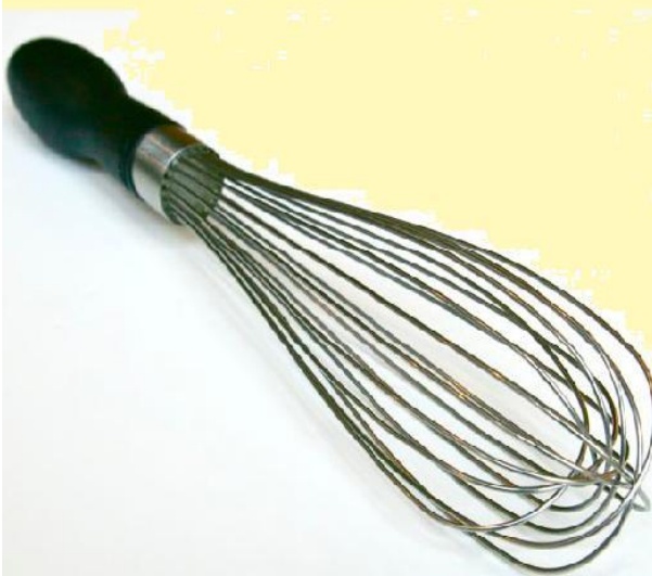
9. WH _ S _