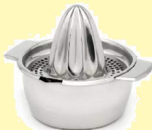
10. J _ _ C _ EX _ _ C _ OR