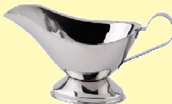
12. S _ _ CE B _ _ T