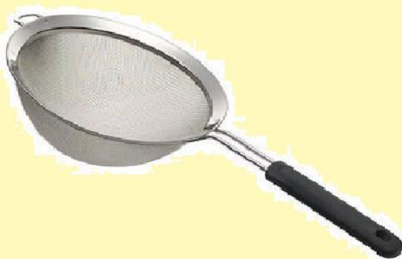
11. S _ _ V _