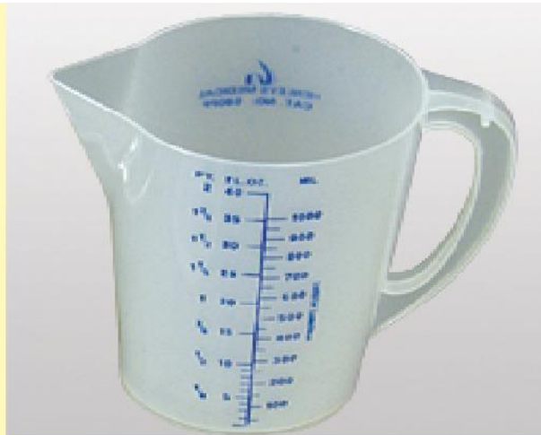
8. M _ _ S _ R _ _ G _ J _ G