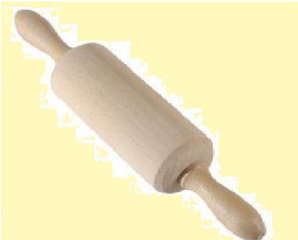
7. RO _ _ I _ _ PI _